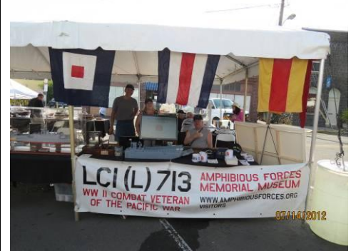
AFMM Booth at Festival

On July 14-16, the crew of the LCI-713 set up a booth with displays for the general public and participated in the 1<sup>st</sup> Annual Maritime Heritage Festival in St Helens, Oregon. The Festival was attended by hundreds of people interested in the rich maritime heritage of the area to include Native American ocean- going canoes, a steam-powered stern wheeler and a WW2 PT Boat. We made a lot of contacts and sold some souvenirs as well. The town even expressed interest in possibly becoming a new home for the LCI in the future. The Confederated Tribes of the Grande Ronde even invited all attendees to a Salmon Bake on the Deer Island across the inlet from the town harbor, and our crew was ferried to the dinner on the Sea Scout Ship "Reliant". A good time was had by all, and we plan on attending next year.