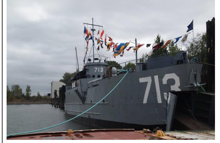
Your LCI-713 dressed up for the reunion while moored at her new Port of Portland Berth.