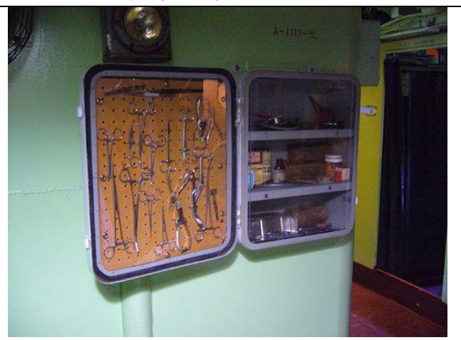
Surgical and Tool Displays, by Rich Lovell