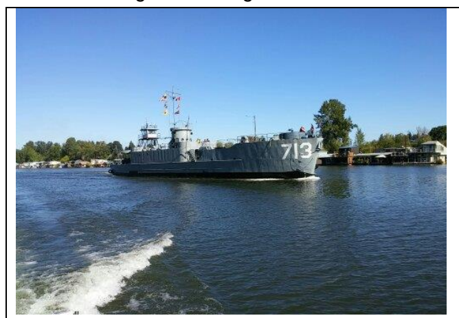
The 713 underway at 15 knots on 9/12/14, on the way home. (Haha, Someday with your help!)

We are very proud to announce that the Port of Portland is now a major sponsor and is providing that long sought home for the 713. We are now located at a Port of Portland Berth in the Swan Island lagoon in downtown Portland and we are directly adjacent to our good friends the PT-658's base of operations. Our members and guests now get a double treat when arriving for a visit.