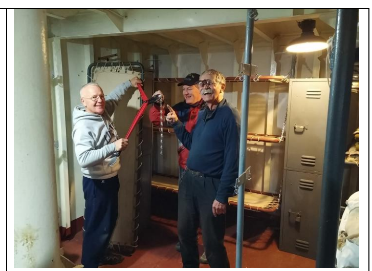
Getting Crew Quarters Finished Up!