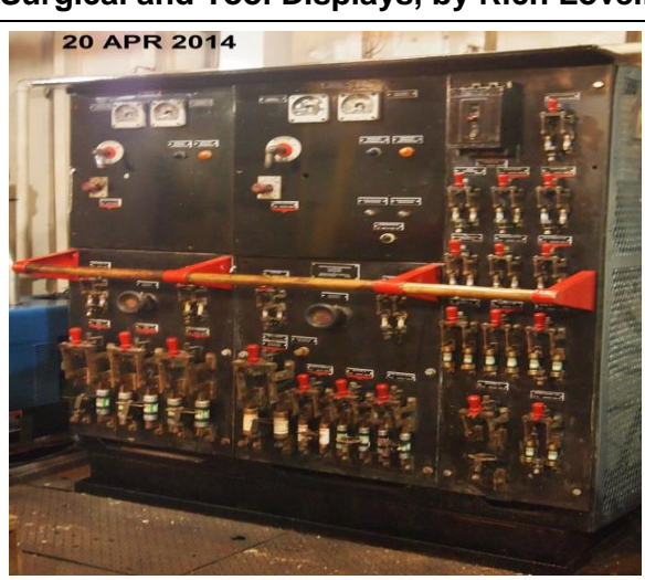
How bout that switchboard!