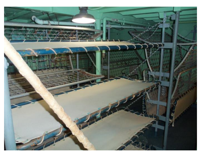
Check out all those bunks! We completed Troop1 thanks to a trade with our friends on the 1091!