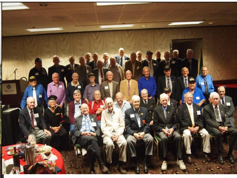
Above: LCI Veterans attending the 2014 Reunion dinner Left: Reunion LCI Veterans boarding the ship thru the bow ramp with the assistance of WWII Living History Actors.