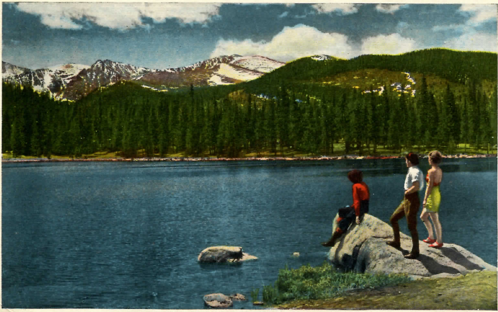
ECHO LAKE, DENVER MOUNTAIN PARKS, COLORADO